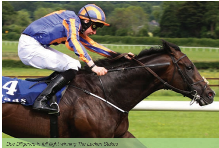
Due Diligence in full flight winning The Lacken Stakes

Included in our top three of new recruits to the stallion ranks with first runners in 2019, Due Diligence has exceeded the expectations of many and soon found himself top of the European Freshman Sires. (Good to see that our other two selections Cable Bay and Brazen Beau also feature high on the list too!). Despite the fact that he's significantly