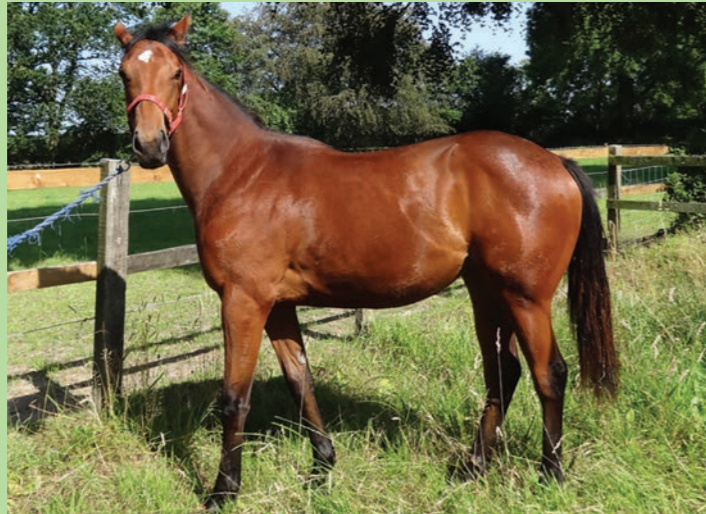
Eaux De Vie - shares now available for her first season