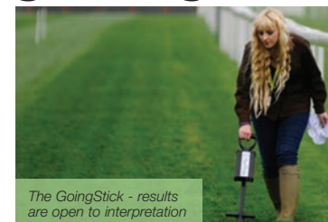
The GoingStick - results are open to interpretation

The introduction of the penrometer, also known as the GoingStick, was supposed to make reports very matter of fact by presenting the going as a straightforward numerical reading. These readings range from zero (bog-like) to 15 (concrete). But many trainers feel that such readings are misleading as much depends not on moisture content but on the structure of the soil and so still prefer to rely on descriptions - heavy, soft, good to soft, good, good to firm, firm and hard. The BHA's intent to ensure safe going means reports are not always accurate since courses just want to always appear to be providing 'good' ground.