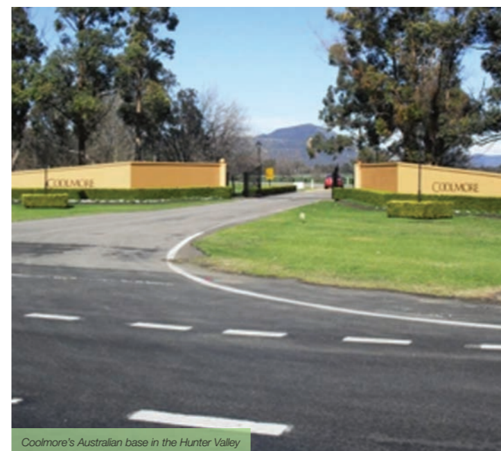
Coolmore's Australian base in the Hunter Valley