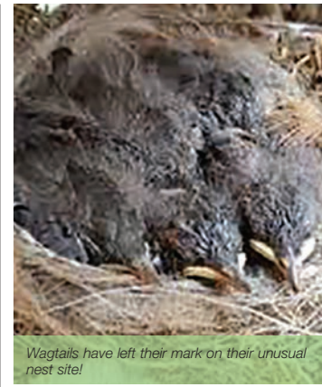
Wagtails have left their mark on their unusual nest site!

Shares are now available in these two lovely home-bred yearlings. Each is divided into ten 10% shares - full details at www.homebredracing.co.uk or simply call 01559 363763 or email us to discuss options at 20% discount before October 31st