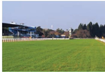
Borrowdale Park racecourse

Borrowdale Park regularly hosts racedays with crowds matching those at the Epsom Derby and up to 80,000 racegoers. In fact it's second only in attendances to Hanshin racecourse in Japan and holds fortnightly meetings throughout the year with a seven race card. But amazingly runners are provided by a dwindling number of trainers of which there are just four left. The local thoroughbred breeding industry used to support thousands of jobs and supply regular consignments to the sales which have now all but disappeared. But despite the apparent collapse of the racing industry it thrives at this excellent turf track. But where is it? Harare, Zimbabwe!