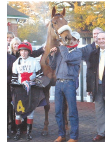
Homebred Star's 100/1 win is worth a watch!

Homebred Racing's YouTube channel has had tens of thousands of viewings in the past year as well as an increasing number of subscribers. Our channel hosts clips featuring winning race replays together with other topics including interviews with top jockeys, Lambourn's training facilities and the birth of Delagoa Bay's foal. Most popular clips are Homebred Star's amazing 100/1 win at Lingfield (where he was a clear last turning into the short straight but swept past the field to win comfortably!) and Celestial Bay's last-to-first win when ridden by champion jockey Richard Hughes. We also have clips about our latest horses giving an insight into their pedigrees by showing how their parents performed on the race track.