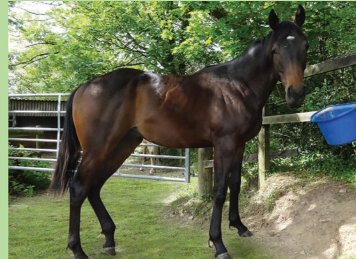
Study The Stars - shares now available for his first season