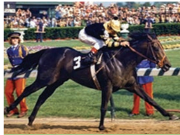
Many great horses including Seattle Slew came from obscurity

Disquiet has been expressed that the Coolmore juggernaut is scooping all the top prizes in a manner similar to Mercedes and Lewis Hamilton's domination of Formula 1. True to say that most of our top races have fallen to Galileo's offspring and Aidan O'Brien this year. But is this just a blip or a sign of more on course success to come? It's certain that the influence of super-stallion Galileo will persist in the short term but, just as was the case with Northern Dancer, it will eventually wane - prompting the search for his successor. And there's also the assurance that however hard racing's big battalions try they will never manage to scoop the whole of