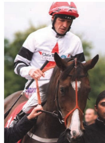
Celestial Bay a winner from 6 - 12 furlongs