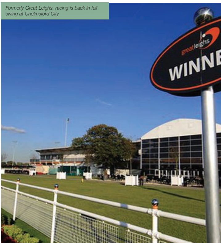
Formerly Great Leighs, racing is back in full swing at Chelmsford City