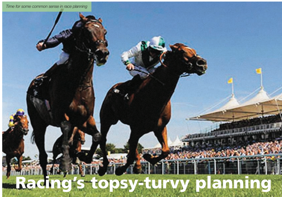
Time for some common sense in race planning

The Qatar Sussex Stakes will now have a total prize fund of over £1 million and the Qatar Nassau Stakes will now be worth over £500,000. Owner of the Goodwood Estate, Lord March, commented "This new partnership with Qatar will make an enormous contribution to horse racing in the UK". Inevitably there will be concern that racing has now aligned itself with a sponsor whose credentials will come under increasing scrutiny due to their World Cup bid. The inaugural Qatar Festival will run from 26 July to August 1st 2015.