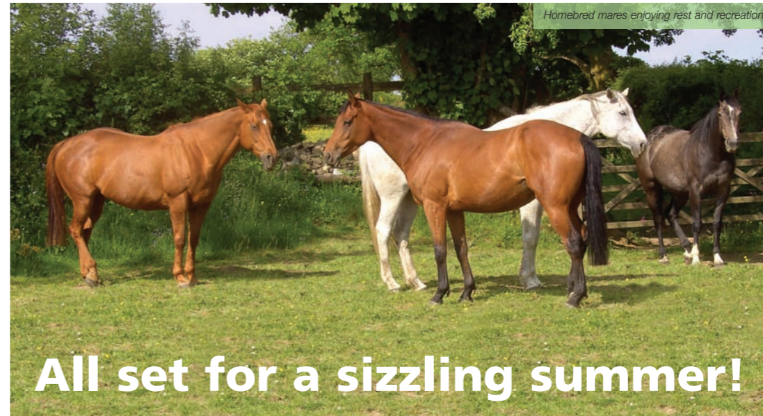
Homebred mares enjoying rest and recreation