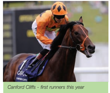
Canford Cliffs - first runners this year

Another battalion of new sires will soon be having their first runners. Progeny to look out for are by Coventry Stakes winner Canford Cliffs, Poets Voice and Zoffany. Frozen Power may prove to be best from the bargain basement - he stands at a fraction of the price commanded by his contemporaries. From across the pond, Cape Blanco, Gio Ponti and Uncle Mo are also likely to secure a measure of success. Canford Cliffs looks a good bet to top the table by season's end.