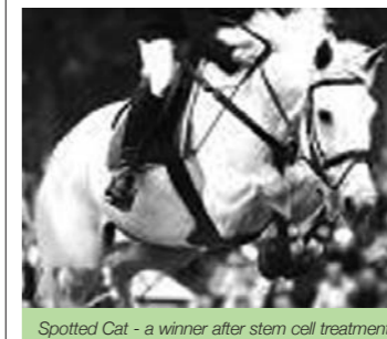
Spotted Cat - a winner after stem cell treatment

The career of many racehorses is often cut short by tendon injuries - particularly jumpers. But recent medical developments in stem cell therapy are now available to equine vets through a French company called Vetbiobank. In simple terms they store material from a foal's umbilical cord to enable stem cells to be used in treatment of any future injury. Currently tendons, ligaments and joints are being treated to repair damaged cartilage by injection of the foal's stem cells direct into the area of injury. Vetbiobank claim that horses treated in this way have successfully returned to the racetrack - including 2 Group winners in France.