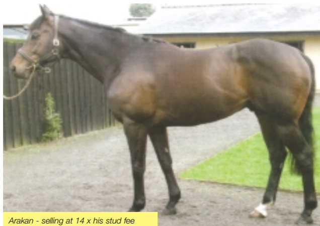
Arakan - selling at 14 x his stud fee

Winners. That's probably the short answer - if you're an owner or trainer. But breeders look at it somewhat differently hoping to maximize the profit by selling youngsters at a higher price than the cost of production. This season's league table assessed on profitability of stallions makes interesting reading. Arakan is the most profitable sire - his offspring generally fetching 14 times his stud fee. He's followed by Acclamation in second place (x13 his stud fee), then Camacho (x11), Kheleyf (x9) and Piccolo (x9). Some you may never have heard of, but the factor they all share in common is a low stud fee - Camacho