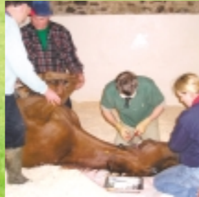
Homebred Star was soon back in the paddock after his 'op'.