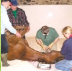
Homebred Star was soon back in the paddock after his 'op'.