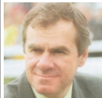
Dr Webbon wants to stop cheats

New procedures mean that samples collected as part of routine dope testing will now be frozen and stored for potential analysis years later. On average one in every ten runners is randomly dope tested and it's hoped that this new initiative