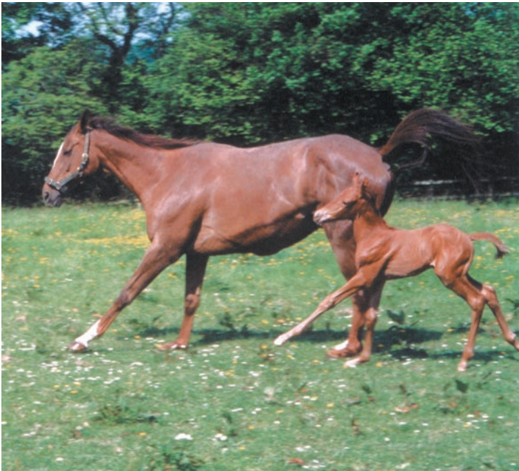
Recovering from a poor start - Gwyl at 4 days old out in the paddock