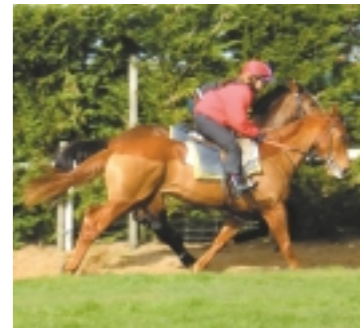
Annie (red jacket) returns from work