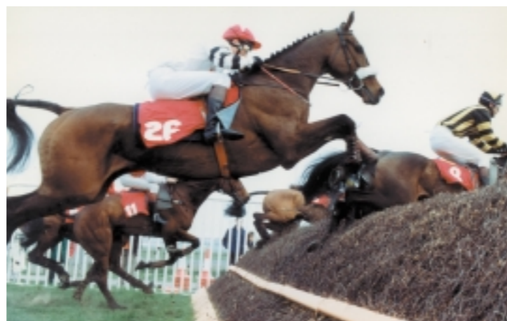
Backpacker flies the open ditch in the 1992 Scottish Grand National

Backpacker was the founding racehorse and retired here in 1994 having graced some of the country's top tracks including Ascot, Kempton, Sandown and Ayr in a career which spanned 6 seasons over