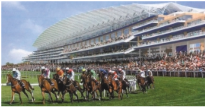
Artist's impression of the new grandstand