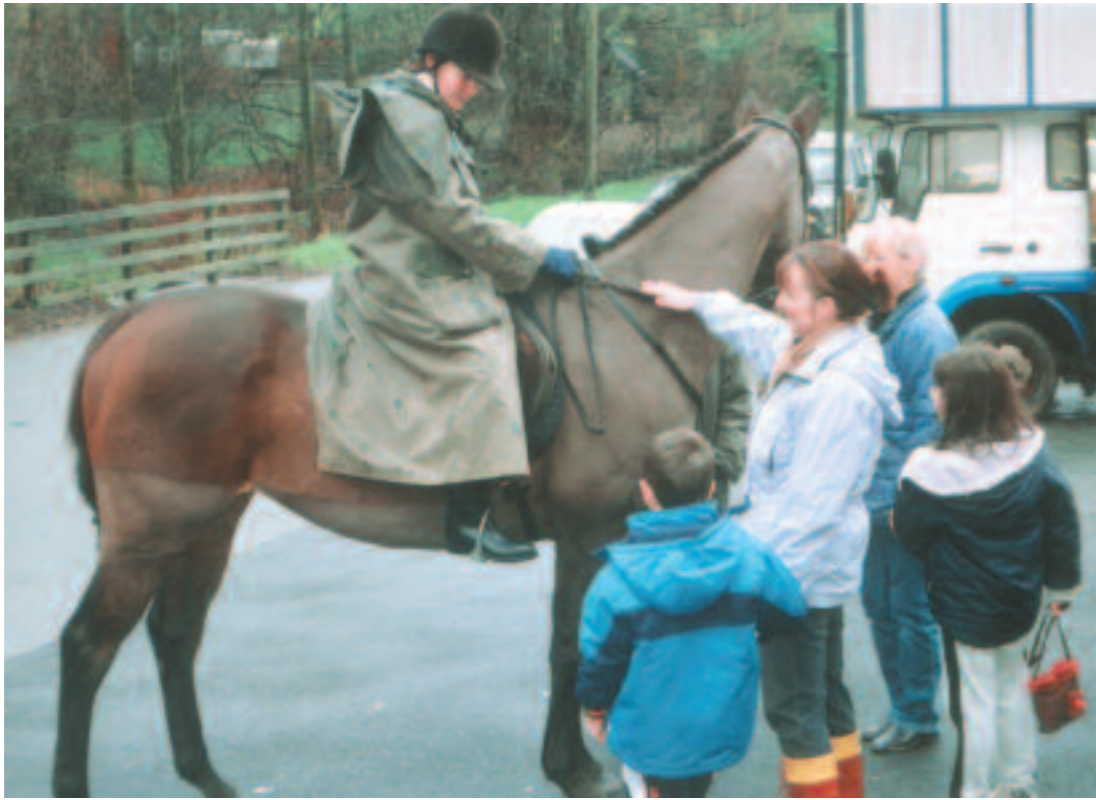
Leo with admirers at a local meet