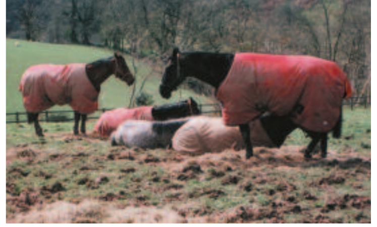
All rugged up and enjoying some winter sun and mud