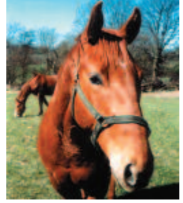
Bugsie - into training this year

Homebred Racing has plenty to look forward to. Horses already in training include Quidditch who we hope, will at last, fulfil the promise shown at home after her summer break. We'll concentrate on the flat with her. Homebred Star has shown plenty of speed and after being gelded will also be campaigned on the flat.