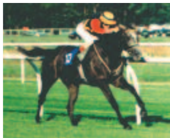
Snowy Mantle winning by 8 lengths at Nottingham

The Hungerford Stakes and The Criterion Stakes as well as being beaten a short head in a Group 1 at Woodbine, USA. He's from a star spangled female line which has provided seven individual Group 1 winners including Hennessy and Editor's Note. Arkadian Hero is by Tremolino who was winner of the Arc de Triomphe and is himself sire of Group 1 winners Snow Polina, Juvenia, Germany and Dernier Empereur. His first foals will reach the racetrack as two year olds in 2005. We are hoping that this match will produce a smart flat type who would stay up to a mile and a quarter. It's said to be impossible to plan to breed a grey but we'll be hugely surprised if this one isn't!