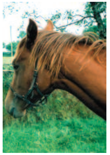
Phizz - now being broken

Our Pharly filly ' Phizz ' is a lovely individual too with a pedigree to match. She's from a top class jumping family including Grade 1 Chase and Cheltenham Festival winners - but, at the moment she looks