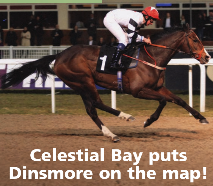
Celestial Bay, ridden by Jack Dinsmore to an easy win at Chelmsford City