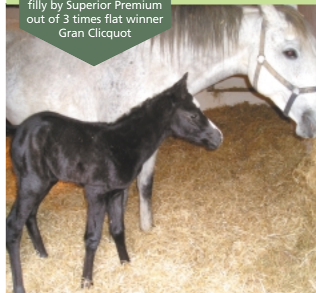
Shown here at just a few hours old this very striking filly foal arrived at the Homebred Stud in the early hours of 25 March

Homebred's latest arrival a filly by Superior Premium out of 3 times flat winner Gran Clicquot