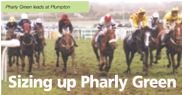
Pharly Green leads at Plumpton