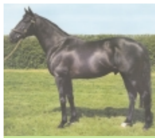
Group winning sprinter Superior Premium

Gran Clicquot's first foal (see page 1) is by Royal Ascot and Group winner Superior Premium who stands at Throckmorton Stud in Worcestershire.