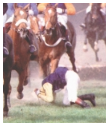
More work for the valet!

The jockey's valet is one of the most important backroom boys of racing. He transports most of the equipment belonging to the jockeys from meeting to meeting and is paid 10 per cent of their riding fees for that meeting. He prepares their equipment (supplemented by the owner's colours, which are brought to the racecourse by the trainer) in the changing room before each race, bearing in mind what equipment each jockey will require for each