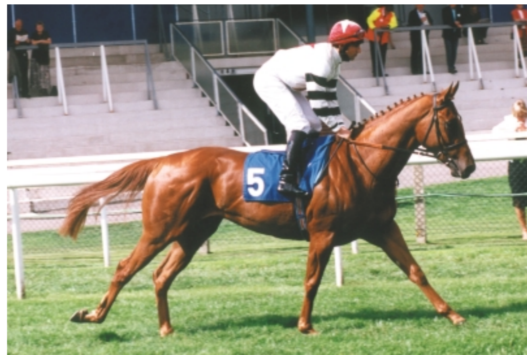
Divine White is already back in work