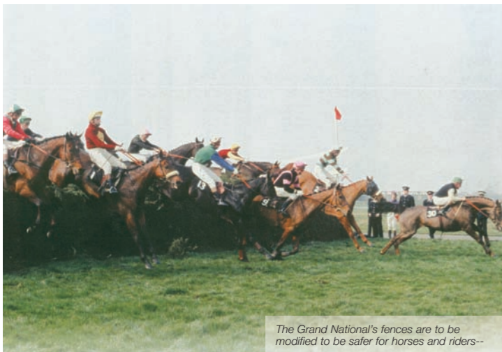
The Grand National's fences are to be modified to be safer for horses and riders--