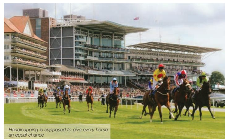
Handicapping is supposed to give every horse an equal chance

Admiral Rous, renowned for his integrity and vigour, was an expert handicapper, and through experimentation