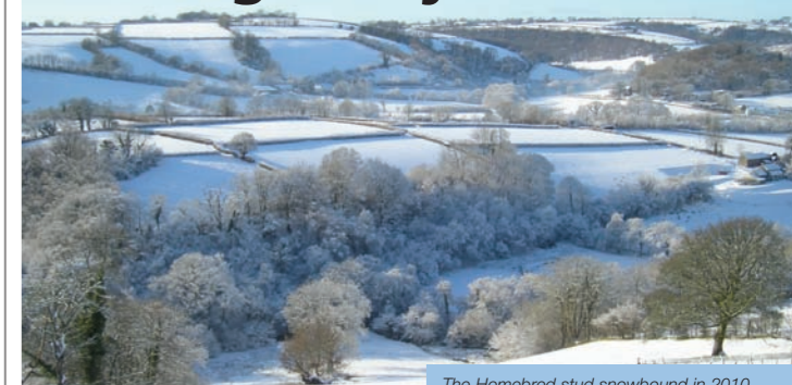
The Homebred stud snowbound in 2010

Whilst the Homebred stud currently offers all the horses a great flush of green, green autumn grass, we'll soon be planning for the winter. Horses do best kept outdoors but from October onwards each will be rugged up against the wet and cold. They'll also be given access to barns and ad lib feeding of haylage will initially be supplemented by hard feed once a day. By December each