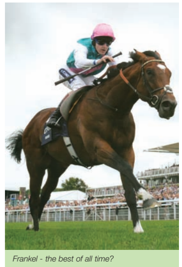
Frankel - the best of all time?

It's official - Frankel may be the best miler of all time. Debate will continue for decades but Frankel's trainer Henry Cecil claims his star is 'The best we've seen'. Better than Brigadier Gerard who slammed the great Mill Reef by 3 lengths in a comfortable Guineas win? The Brigadier went on to achieve a record Timeform rating of 147. And is he better than the great Tudor Minstrel who won his Guineas by a massive 8 lengths? Frankel will have a further chance to prove his greatness by remaining in training as a 4 year-old next season.