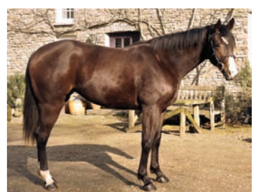
'Sky' better known as Celestial Bay

trying to dig them out of their burrows - the resulting earthworks! We've never experienced a horse behaving like this before - and it's a new hobby now being closely watched by all the other fillies!