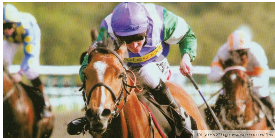
This year's St Leger was won in record time

This year's running of the St Leger in record time, despite adverse conditions, demonstrates that the modern racehorse stays further, longer. The widely held misconception that stamina is on the decline is a fallacy. But there has never been any evidence to support this misguided notion. Tracing the development of the winning times for the Derby and Oaks over the previous 100 years points to the exact opposite of what the 'good old days' school would have us believe.