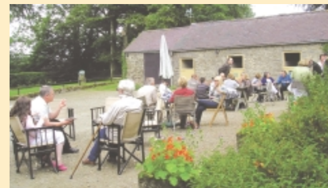
Buffet lunch in the stableyard