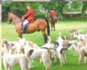
The Llanwnnen Hunt

Yorkshire, Suffolk and Cambridgeshire to enjoy meeting other owners over a glass, or two, of fizz and a buffet lunch. Recent runners were on show with those about to go back into training.