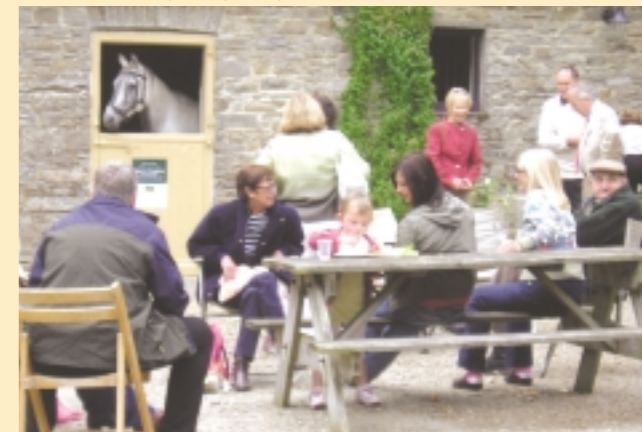
Broodmare Gran Cliquot keeps an eye on visitors!

48 hours later at the Royal Welsh Show. It was ultimately a long day for their Master and Huntsmen as the sudden arrival of summer meant tractors worked late into the night cutting our hay.