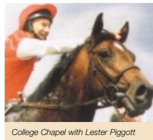
College Chapel with Lester Piggott