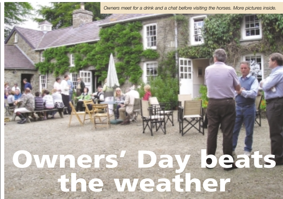
Owners meet for a drink and a chat before visiting the horses. More pictures inside.

Ascot has become the latest addition to the select group of courses to receive the ROA Gold Standard Award. Ascot's prize-money is unsurpassed among British courses, totalling £9.4 million in 2007/08, thanks in part to an executive and sponsorship contribution of 50.9%. The course has also enhanced its hospitality for owners with runners, expanding their complimentary food offering to include a substantial buffet. Gold Standard activity is set to continue in the coming weeks, with Chester agreed as the next course to receive the award.