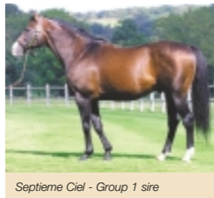
Septieme Ciel - Group 1 sire